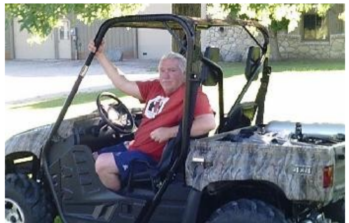
Beside the IH Tee, note special cargo area for SCUBA