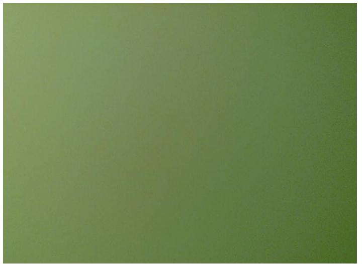
UW shot of Cora on bottom