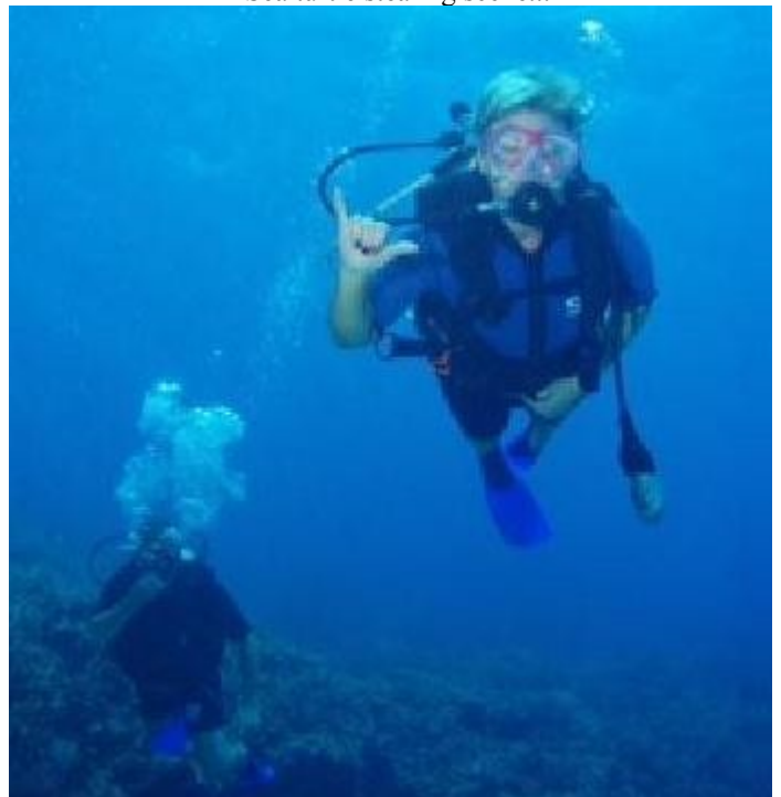
Warm and clear!