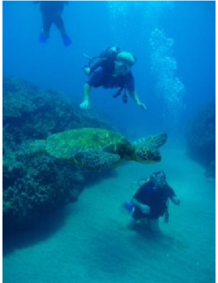
Sea turtle stealing scene...