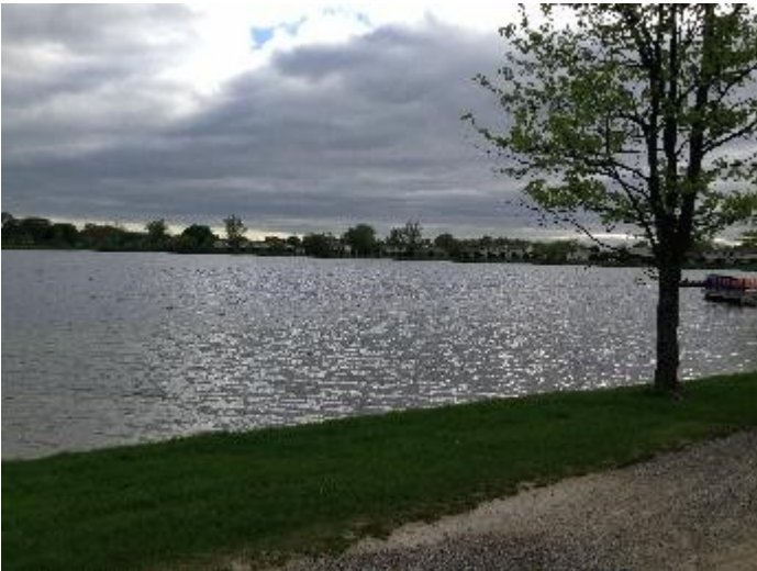
Tues, 6:30pm- Haithco Lake quiet...