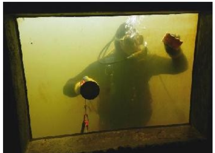
UrEd finishing his window with the 'Magic Eraser' (note the window is clean; the water has become very cloudy)