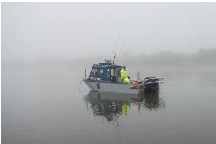
Weather gets really bad!