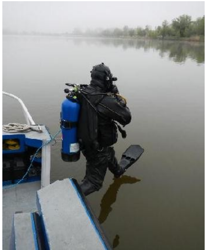
MSP diver in (note fog building)