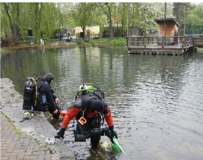
Enough publicity; time to go to work...