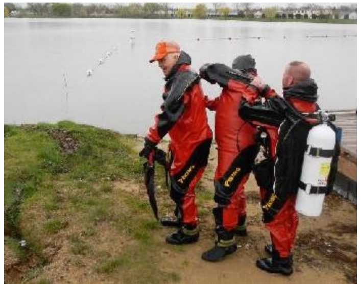
Note boundary line in place. (the three what?)