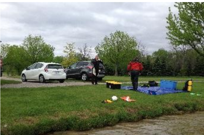
Back up; spread your gear,...