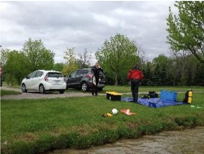
May club dive; Haithco Lake