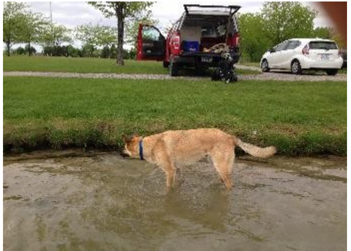
-also wanted to get wet...