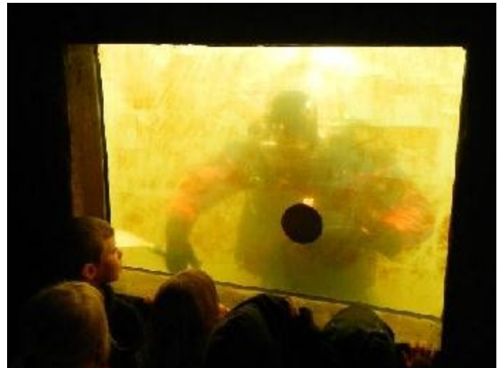
"Look; we can see the guy!!"