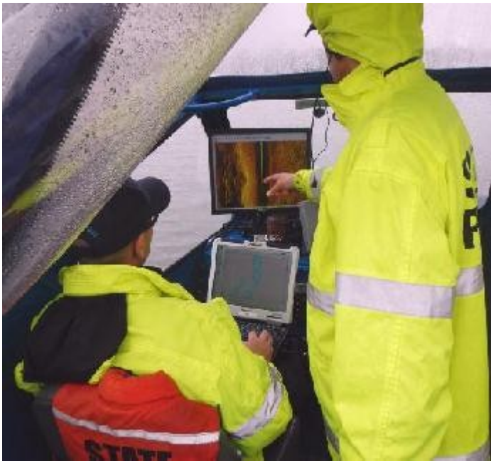
MSP reading SONAR