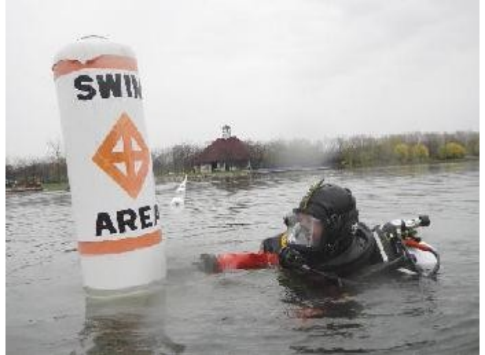
Buoy anchored in place by Garner