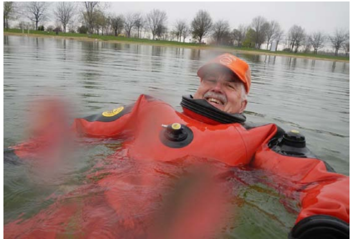
Remember this is work...