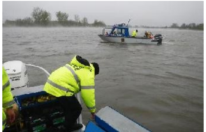
MSP activates a second boat