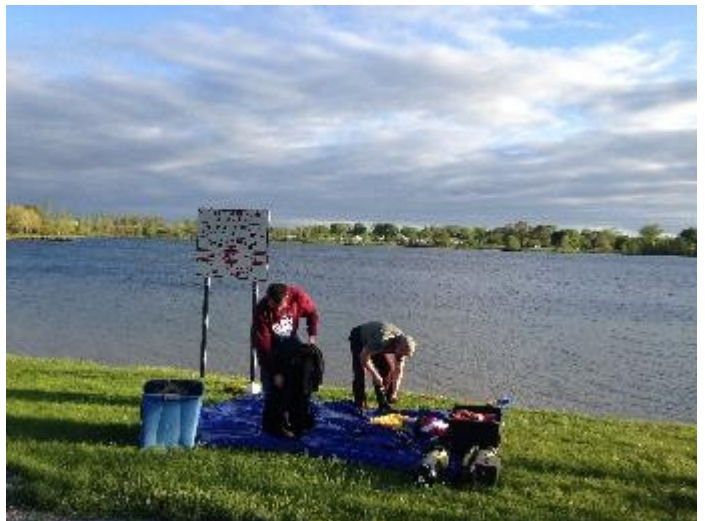
Packing up time; still light!