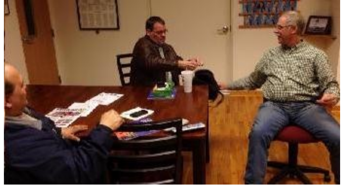
OK; Draw again....