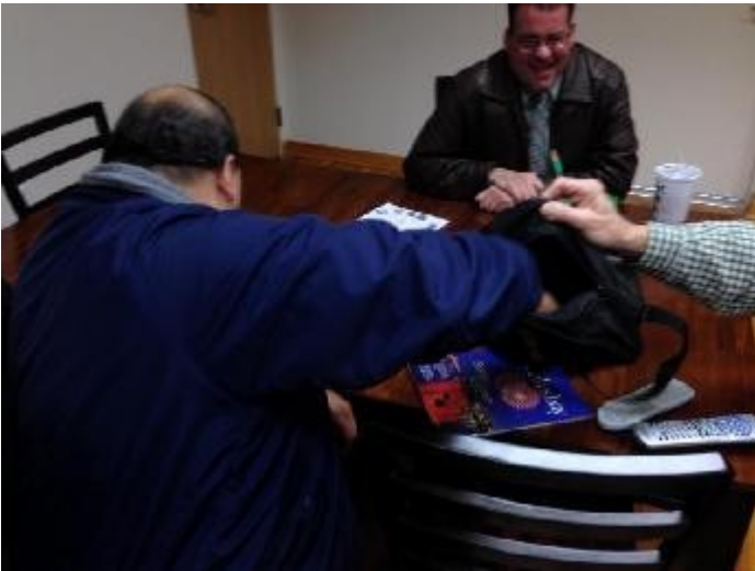
-Some suspected irregularities, and demanded a redo