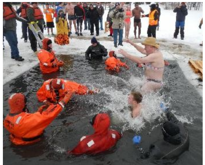
-and direct them to ladders in the back corners to exit.