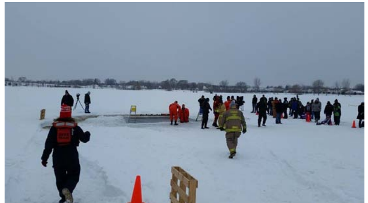
Special Olympics Polar Plunge at Haithco Lake (Prenzler)