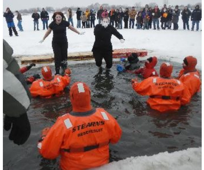
Time to jump!