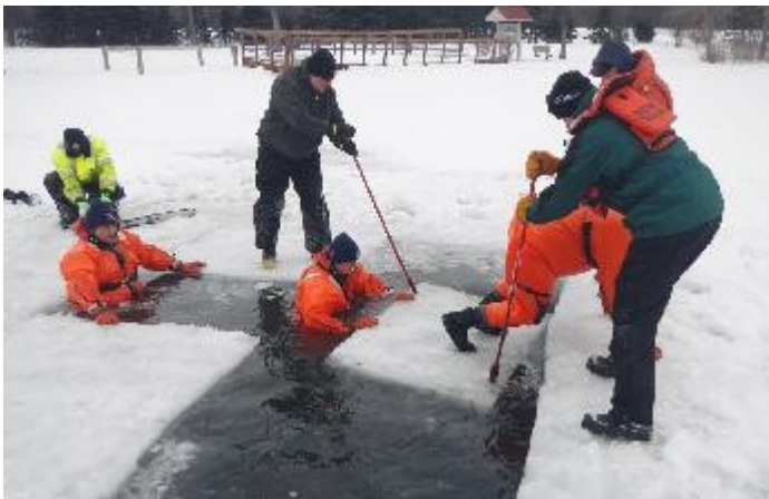
Inside (smaller) chunks are cut out, and shoved under the ice.