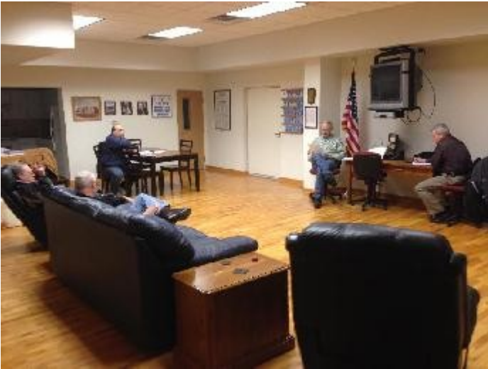
Slow start..... (knock at door?)