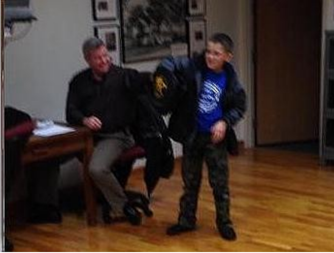
Originally drawn by an unbiased spectator