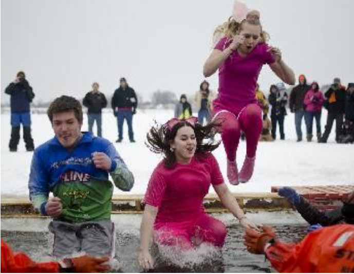
Note big smiles

Workday in early Feb; weeks before fun at the Polar Plunge... also at Haithco Lake. And the ice was thinner.