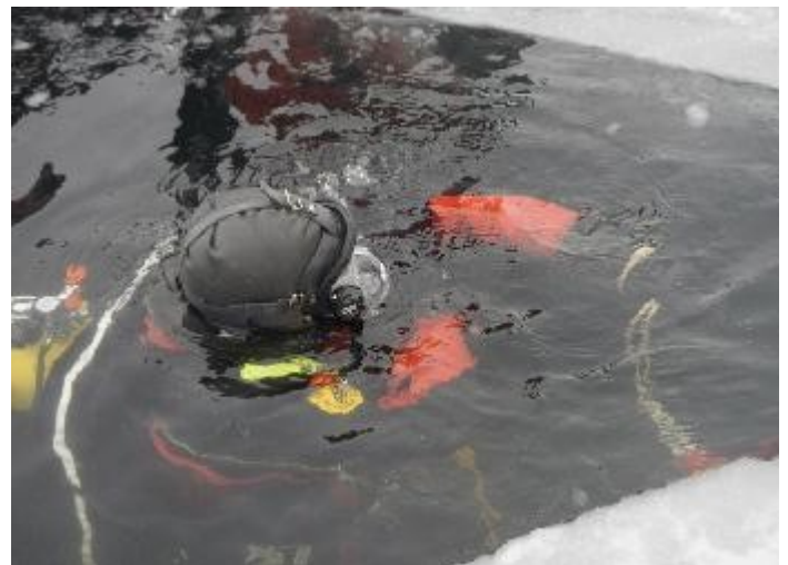
Dive Team training