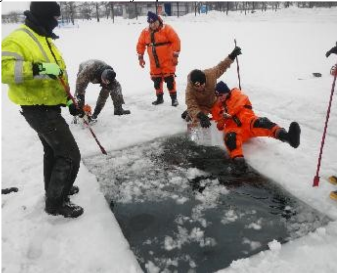
First, a rectangle is cut out of the (18") ice.

Again, SUE club members got involved in their community by volunteering to help at the annual Polar Plunge at Haithco Lake. The County Dive Team has the responsibility of cutting the hole and providing safety personnel for the jumpers. This has been the practice for a number of years now, and the organizers of the Plunge depend on the DT or the event could not happen. To participate in the jump, each jumper raises money for the chance to jump into freezing water; this year there were 170+ jumpers. Good turnout!