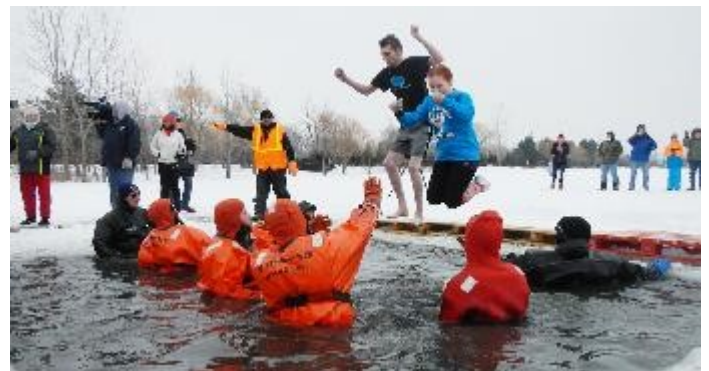
Personnel in water .assist jumpers after the initial shock