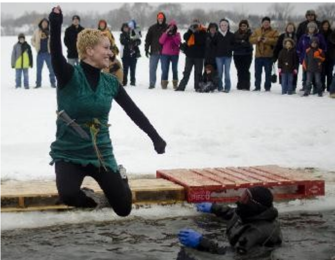
as they jump in-