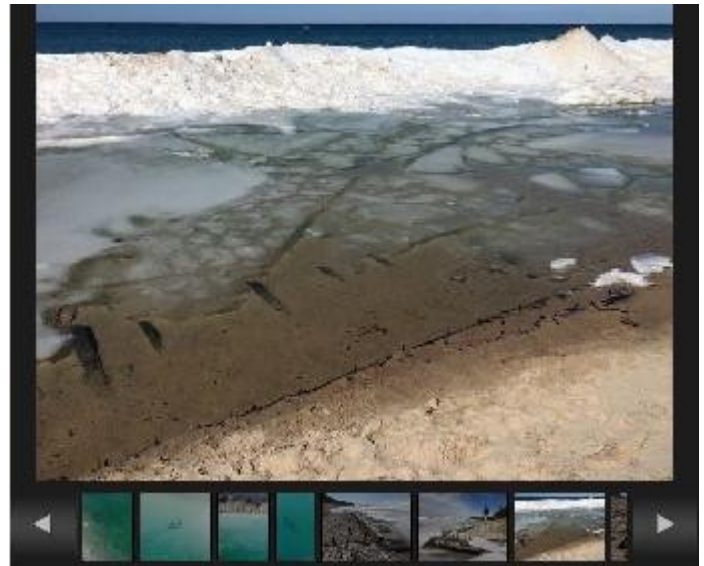
Sleeping Bear beach wreckage; featured! (MLive)