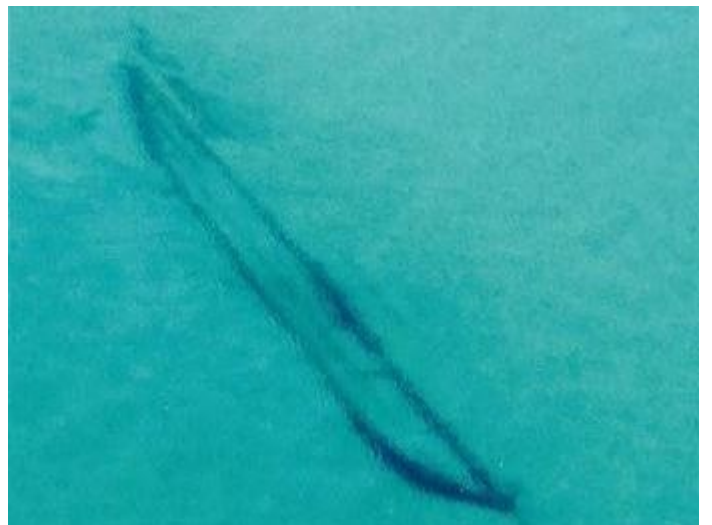
5. Closer view of the McBride