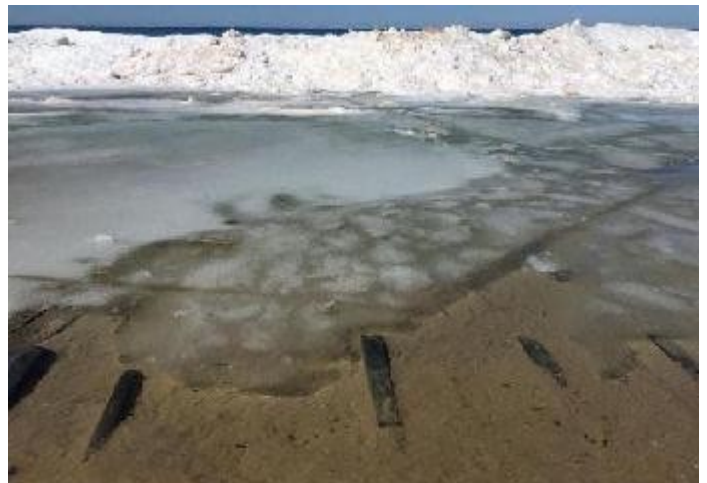
'Jennie and Annie' periodically exposed

Faithful readers will remember the article on the 'Jenny and Annie' beach wreckage exposed at the Sleeping Bear Dunes National Lakeshore. The imagery at the Dunes is photogenic in itself, but with the recent finding of the 'Jennie and Annie' new interest has added even more photos of the area wrecks.