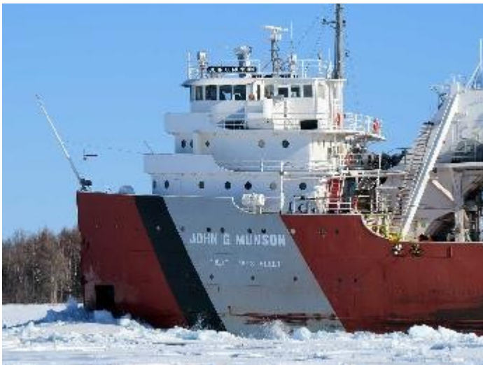
-Seems like yesterday... (by Uhlman)