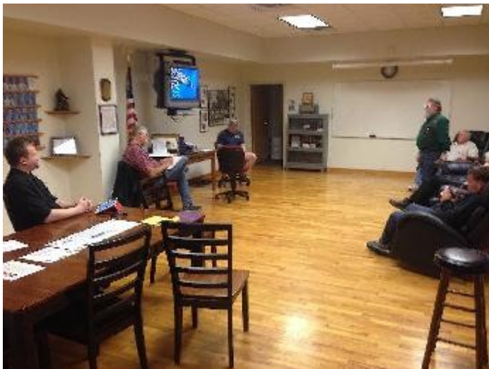
Interrogation of new member...