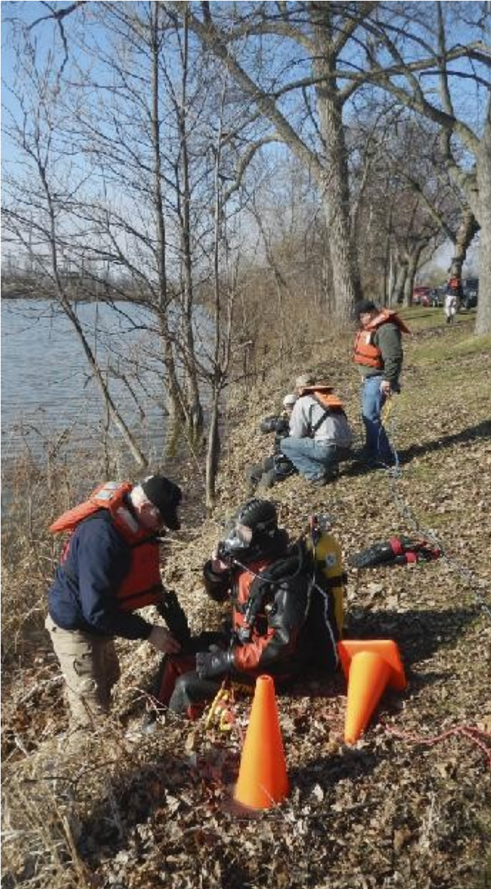
-By the shores of Gitchie Ojibway....