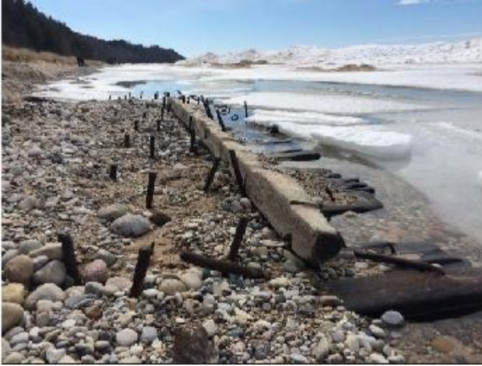
Unidentified wreckage along lake shore