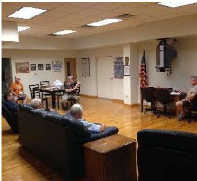
The few, the faithful...