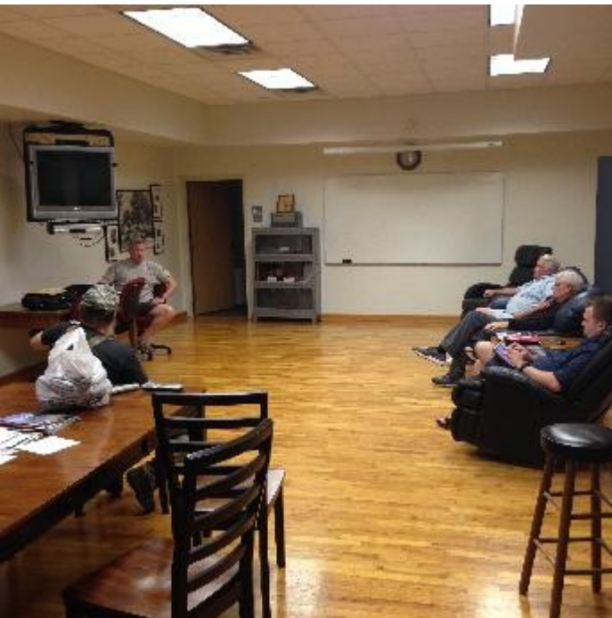
Now in session!... note bag of apples on table; refreshments