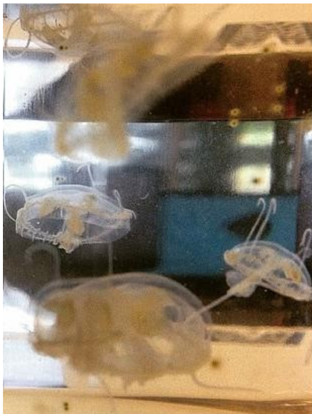
-these found in Burt Lake

The freshwater jellies have spread throughout the globe; in the U.S., there's only six states where they haven't been sighted.