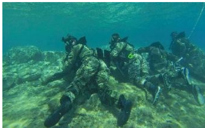
Green Berets from 3rd Special Forces Group (Airborne) and Marines from Marine Special Operations Command crawl across the Red Sea floor on a closed circuit dive during Eager Lion 2015 in Jordan.