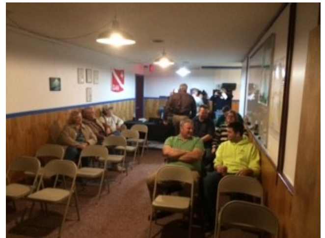
And guests arrive....