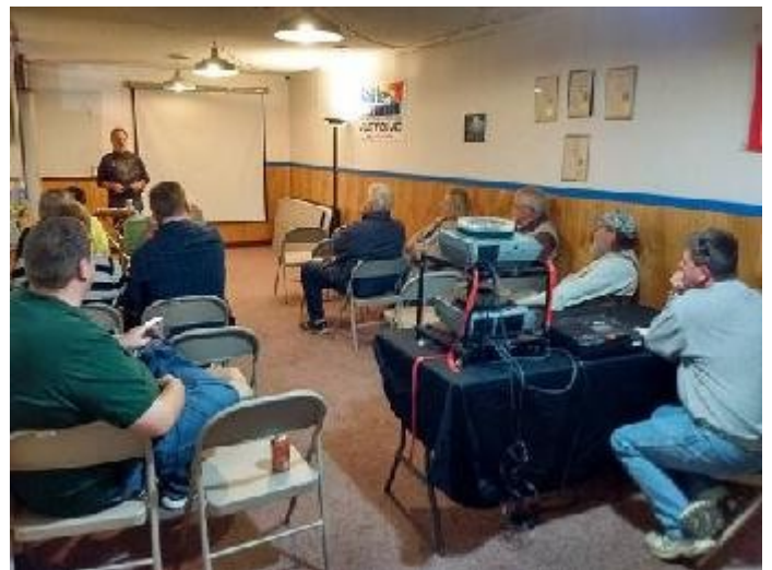
"The Saginaw River has a fantastic history..."