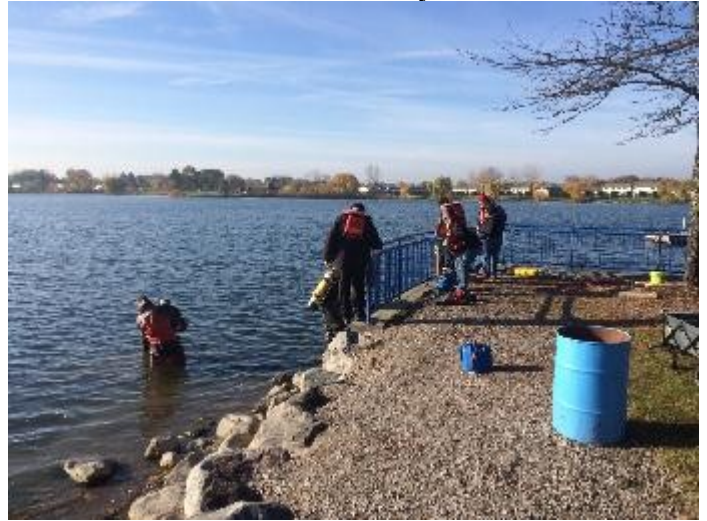
Dive Team finds a clear day, heads for Haithco...