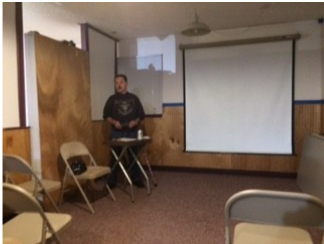
“Let me tell you one more story-...”