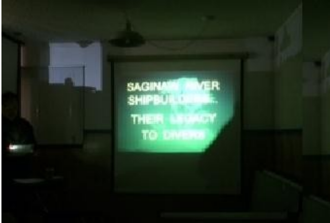
“Saginaw River Shipbuilding- Their Legacy To Divers”