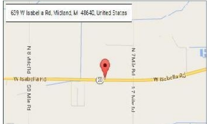
UWA location- map misleading; shop on south side