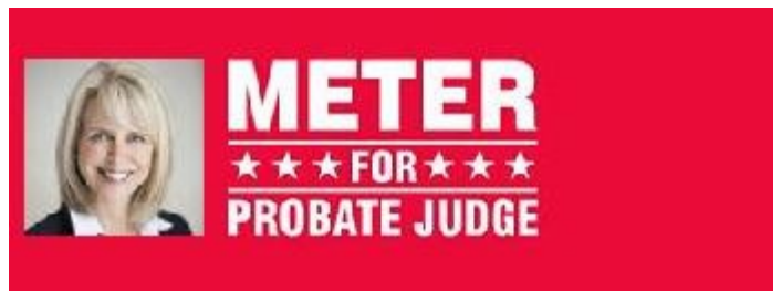
Be involved with politics!