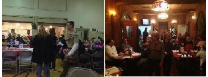
Attend social events!

The SCOOP Corporation is looking for a new editor. The old editor has been in place for over 10 yrs, and it's time for new ideas. This is a great opportunity to express your personal feelings with editorial privilege, and pad your resume. Many benefits!