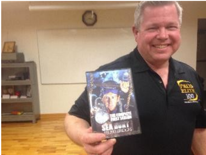
Meeting closes with-