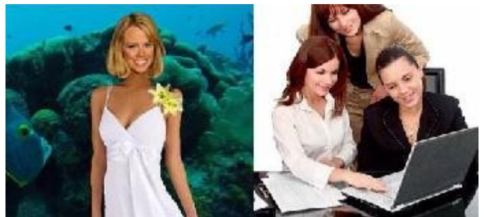
Work with beautiful women!