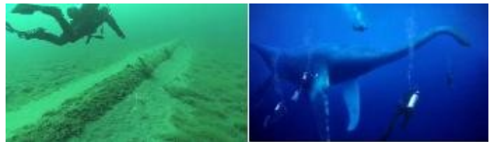
Be involved with controversial topics!