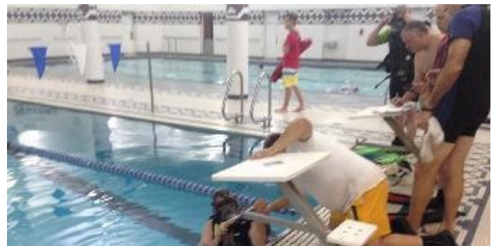
DT 7am pool training at the Y