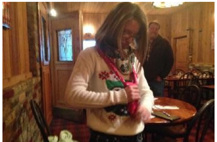
L.E. practicing the knot