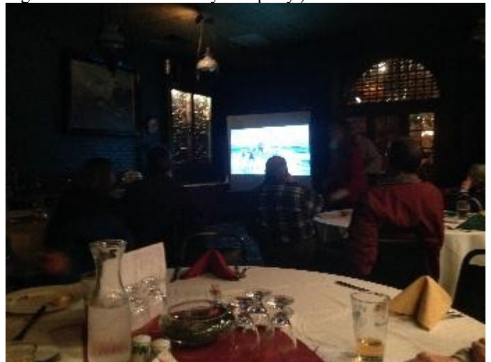
Historic pictures capture everyone's attention