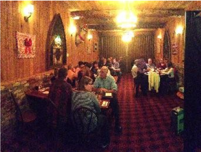
And the club's (almost) all here!

Great festive way to finish the 2015 year! We gathered in our regular room; shared stories, and slowed down just a little in order to eat.