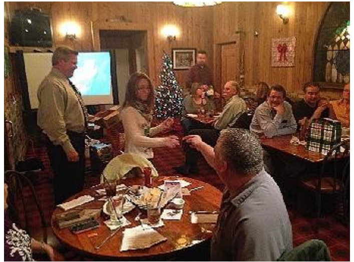
Better make sure Dad wins something; left out last year!