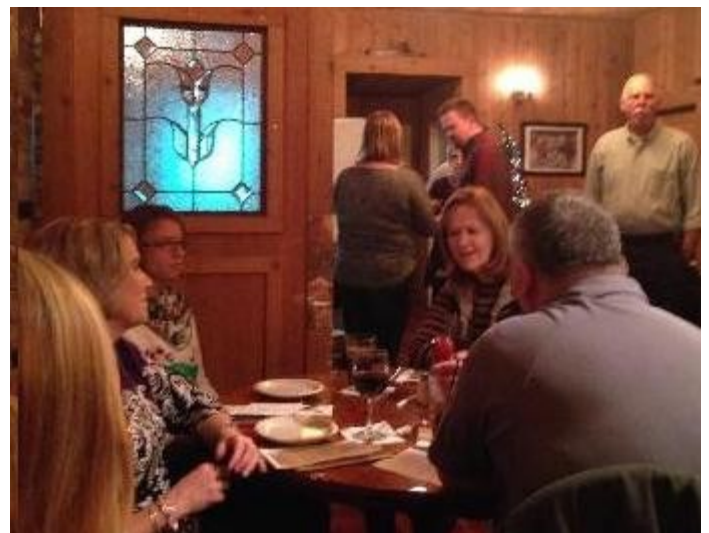
And the chance to update news.