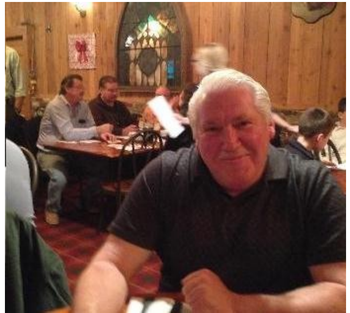
Friendly holiday atmosphere!