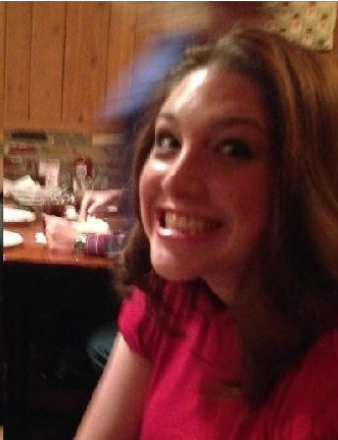
Cutest smile winner