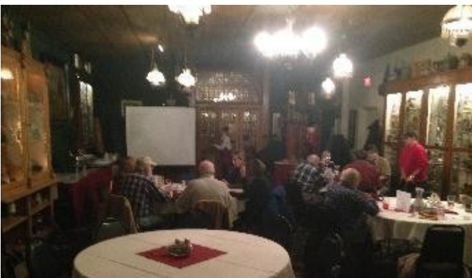
USLSS show at the Stein Haus