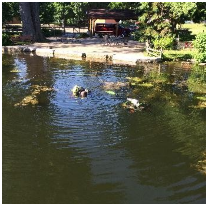
Divers swim over top of grass approaching window area