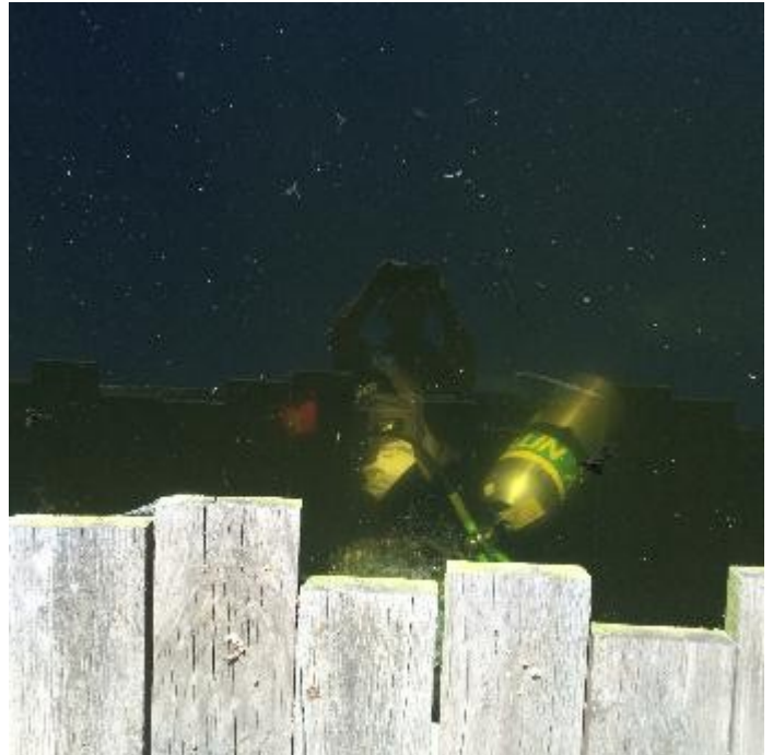
Award-winning artistic photography; look closely ...