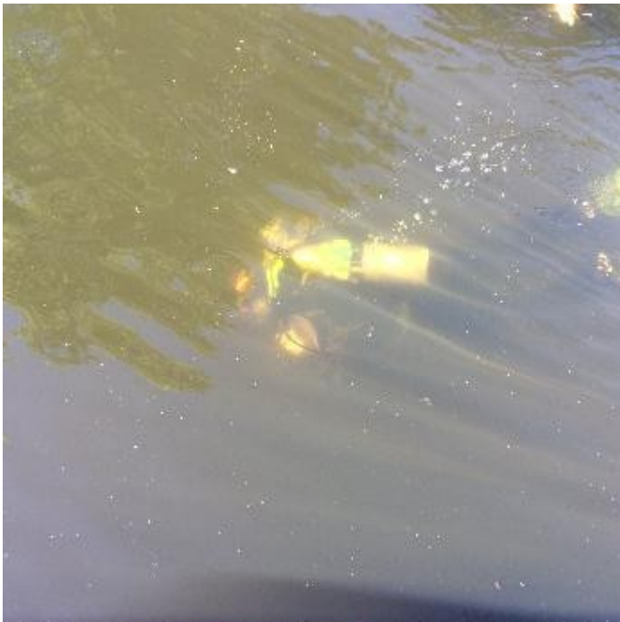
Justin easily visible from platform over 'cave'