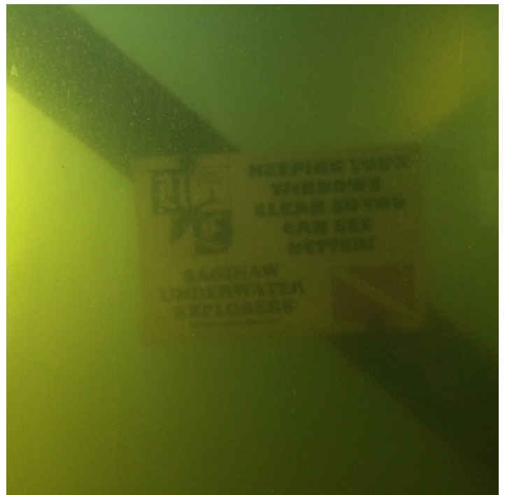
Read OK? Window is clean; water stirred up