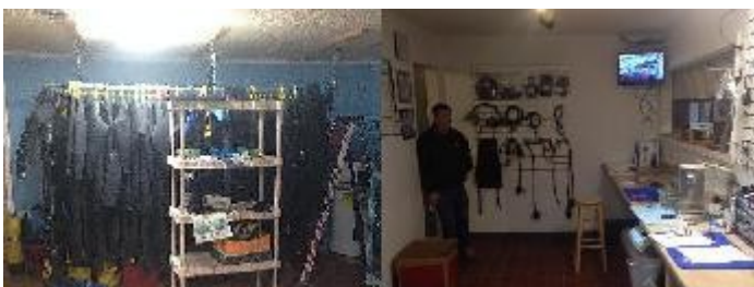
Suit drying room