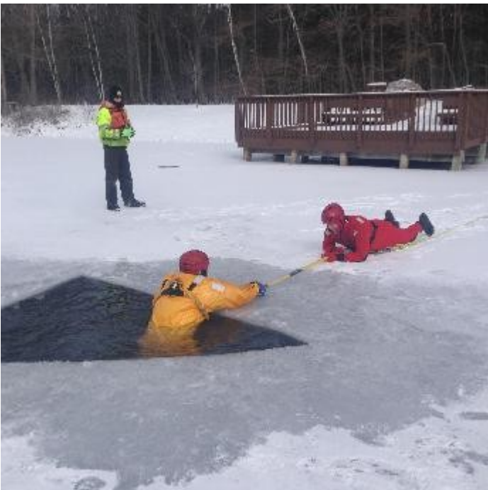
Pike pole pull...