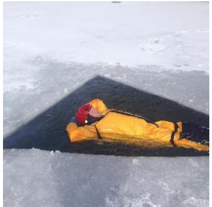
Water still 33 deg, but comfortable...