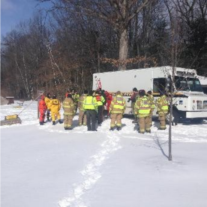
Class gets last minute instructions....