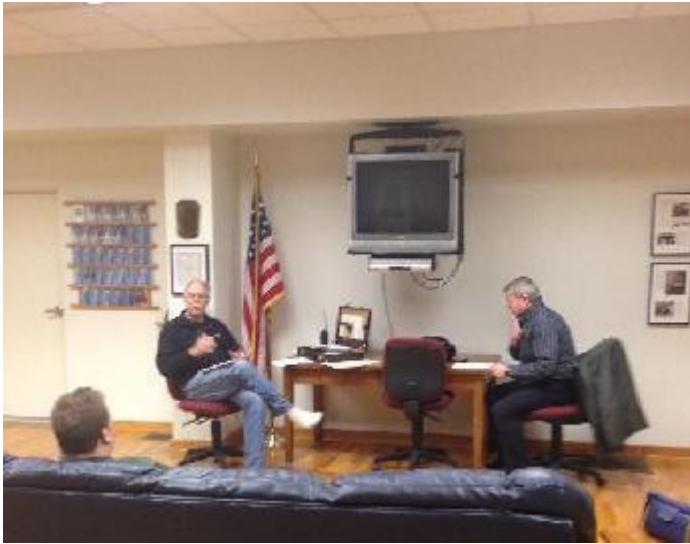
Voting begins; results follow-