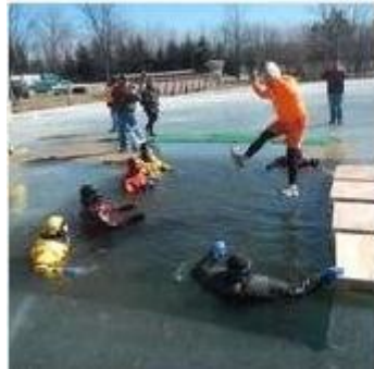
First one in!