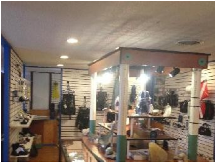
Main display room