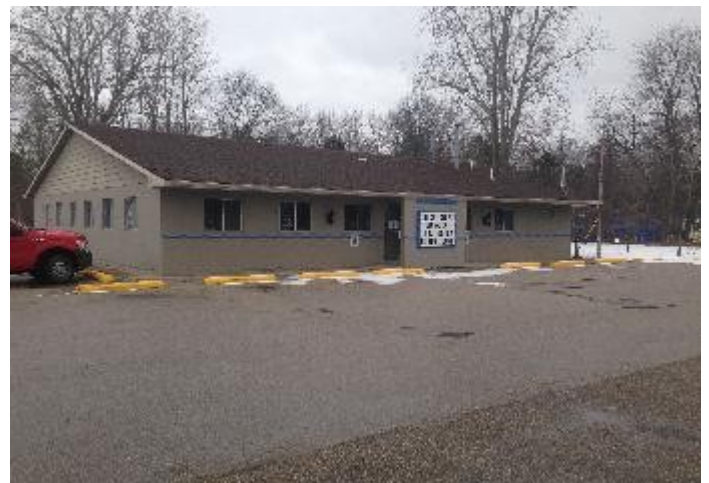
Just west of M30 on M20. Let's go inside!