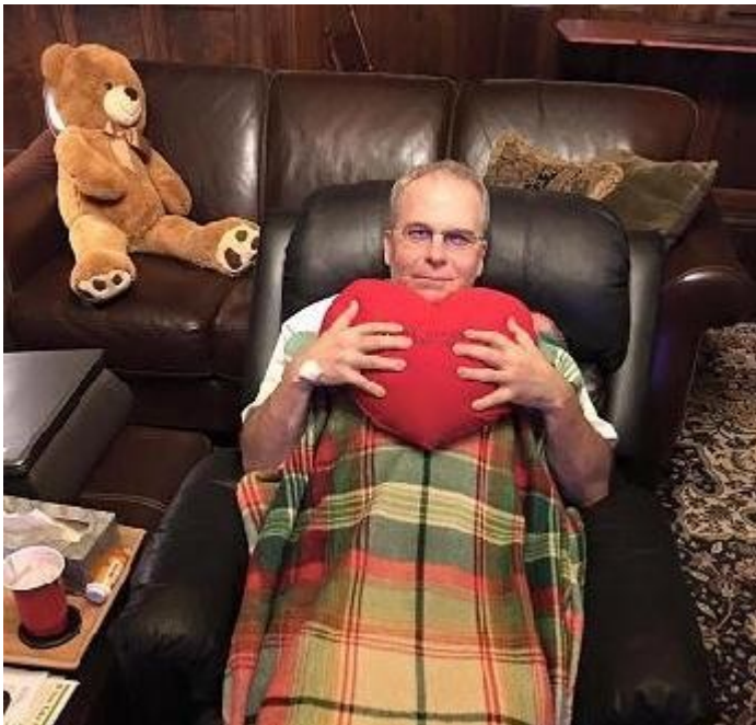
Certain Recovery! The SCOOP wishes Bill and Bill Good Healing!