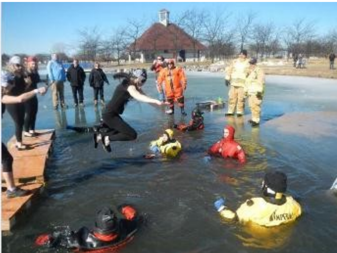
Water temperature, 33 deg!

Feb Meeting Election Results DT/SUE Feb Activities Ice Rescue, Polar Plunge Homebound Members also selected short subjects