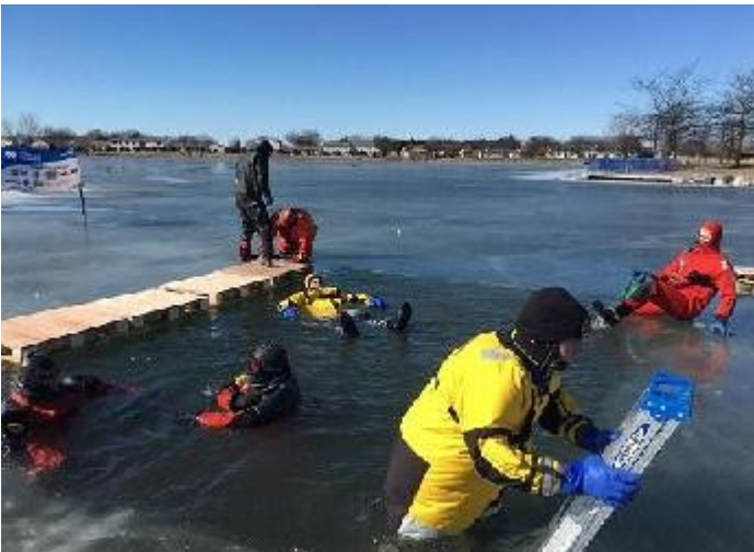
Then into the hole to test the water...