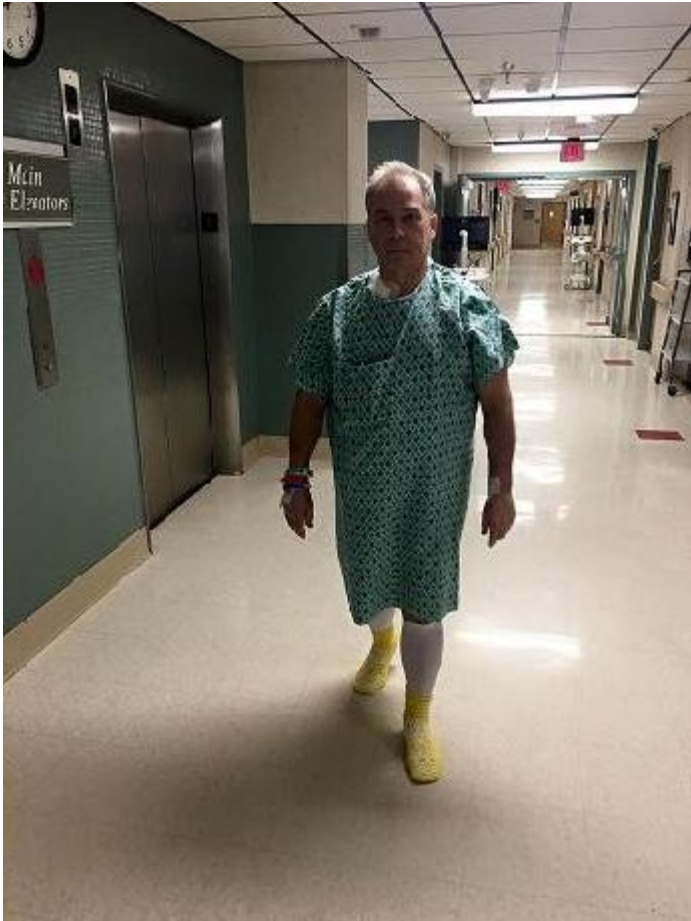
And this is like two days later!