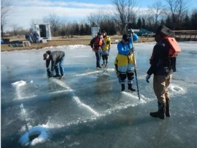
First, the 'cut-the-hole' gang...

Again, service and safety given by SUE/DT members for this worthwhile annual event. This time the weather had gotten so nice there was some concern the ice wouldn't be thick enough. Not to worry, there was plenty; and it was a successful event.