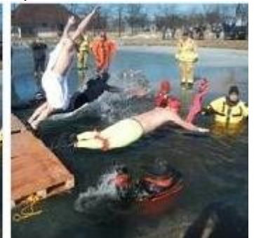
and who can make the biggest splash?