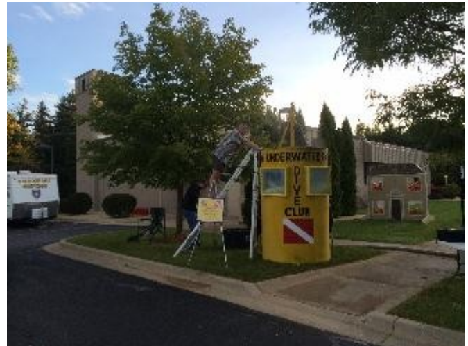
Mike on top steering the hose to fill the tank