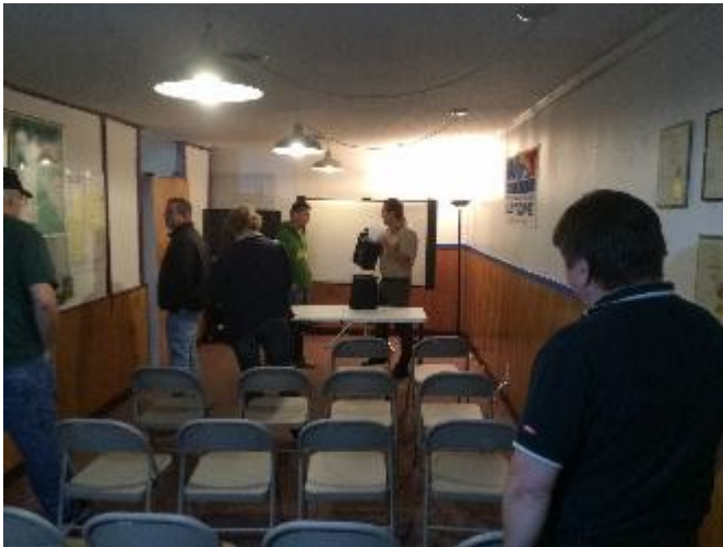
Nope; we're not ready to leave yet...