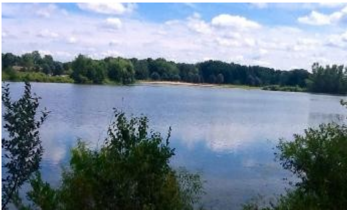
Return to Puffers Pond...