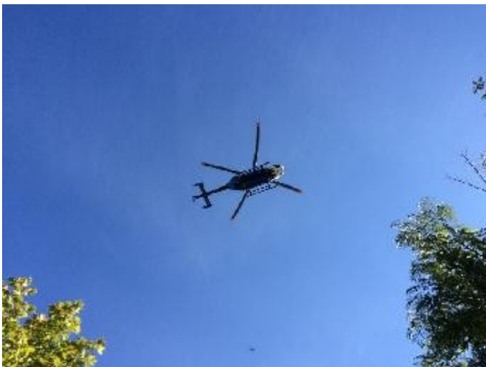
Hilo hovering over our tank to view diver....

The UnderWater Antics dive shop on M20 offered an open invitation to attend a special presentation by the noted Ric Mixer on ship wrecks in the Great Lakes. This particular presentation was "From 1935 to 1975"; a combination of slides and video of various shipwrecks.