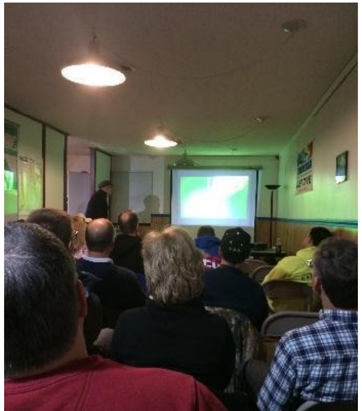
Really a quality show!