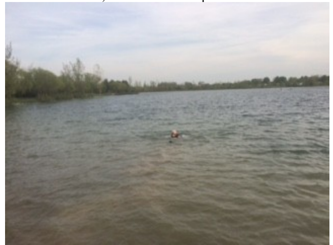
-Down at submerged marker buoy

Divers followed the lines to the three boats; cleaning the growth off everything as they went. Boats are now reported as clean! They also reported good vis, with lots of fish!