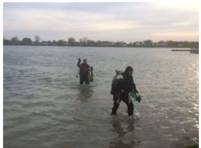
Hearty wave from Justin...

Divers followed the lines to the three boats; cleaning the growth off everything as they went. Boats are now reported as clean! They also reported good vis, with lots of fish!