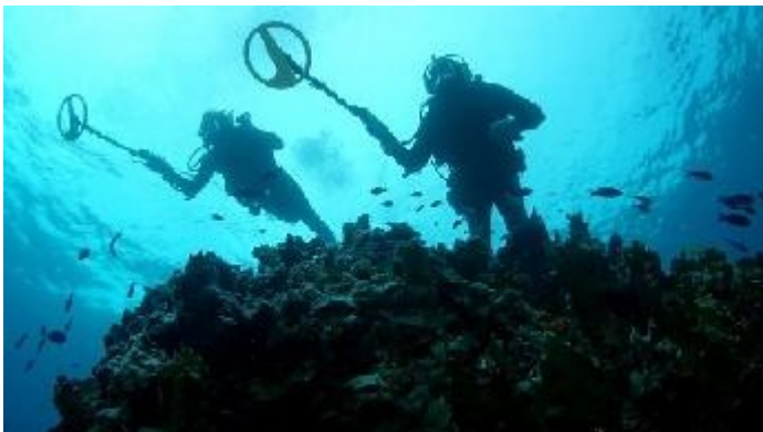
??? - Ask Cora inside