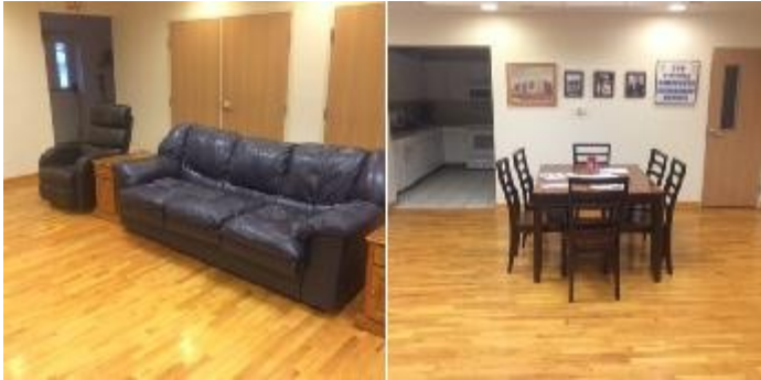
Not a promising April turnout...