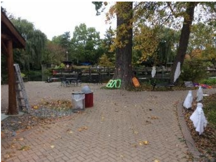
Prep for Zoo Boo

Meeting Attendance Way Down Haithco Splash Dive Zoo Boo 2017 also selected briefs