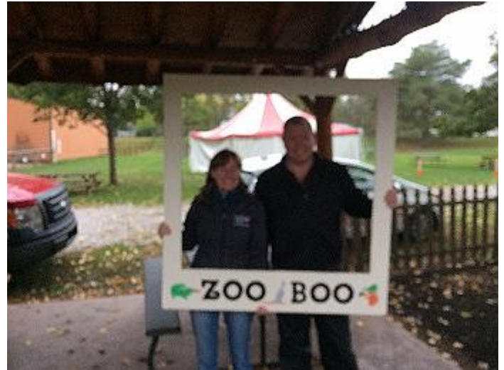
-Caught up in the spirit...

Saginaw Childrens' Zoo, featuring the annual SUE underwater pumpkin carve! This is why we keep their windows clean all year. Not waiting for Halloween, we chose Oct 21 to set up our entertaining expo tank and carve pumpkins. Beautiful day; warm with lots of sun. And again this year, they loved us!