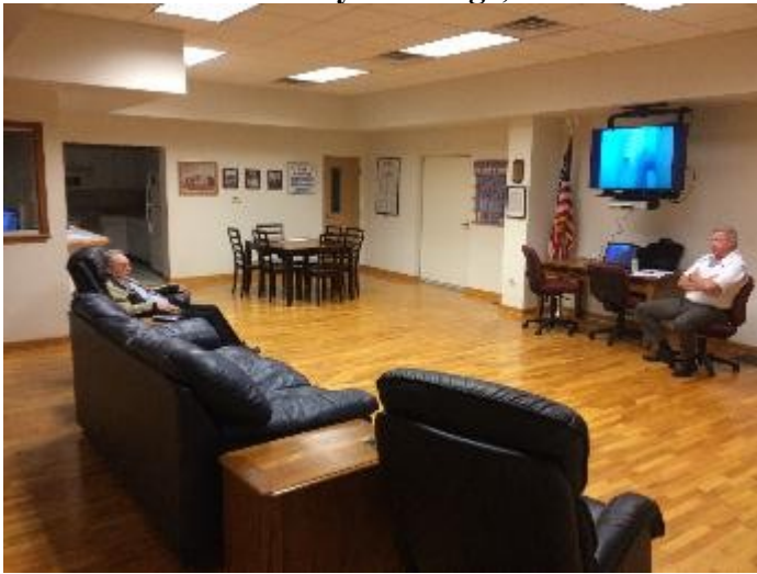
Call to order