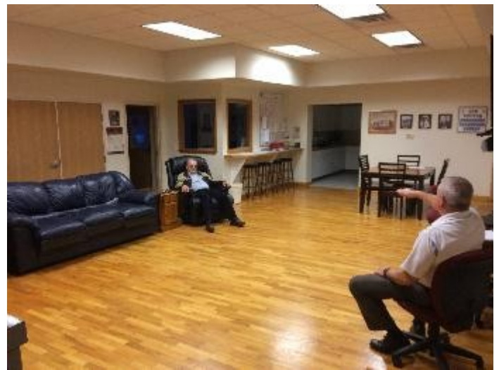
Motion to start vehicles?