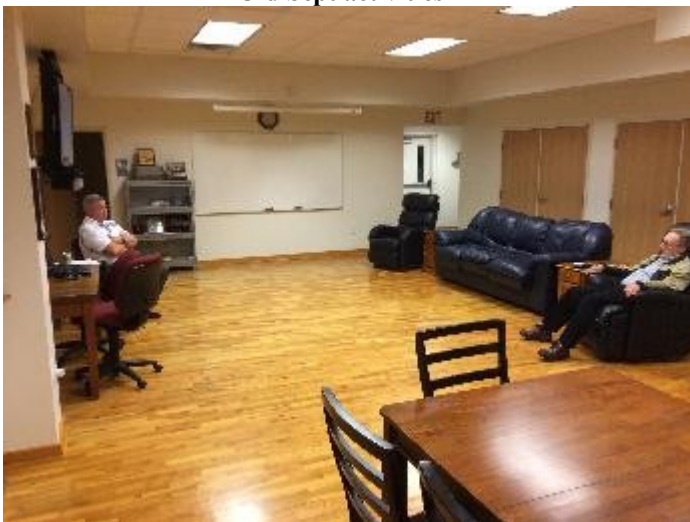
New Oct activities