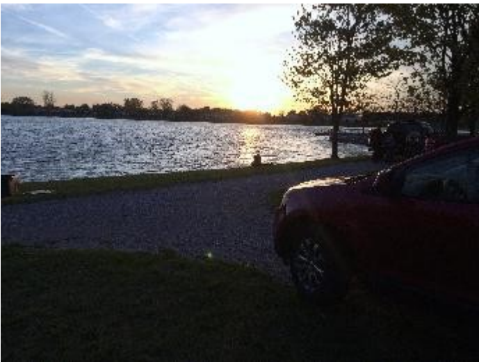
Sun setting itself over in the west....