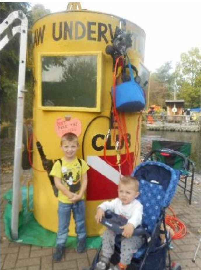
Visitors from Greenville!