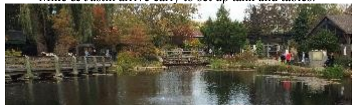
Our working area