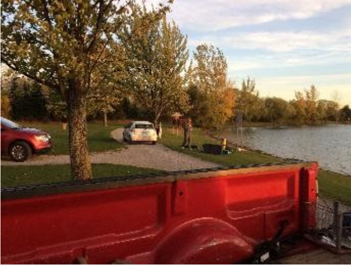
Mike F. setting up near the no diving sign