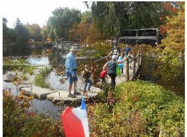
Rock walk to underwater windows