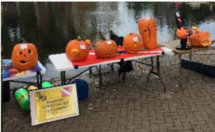
The 2017 entries!