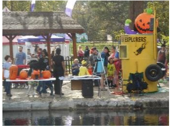
Final rush before shut down...