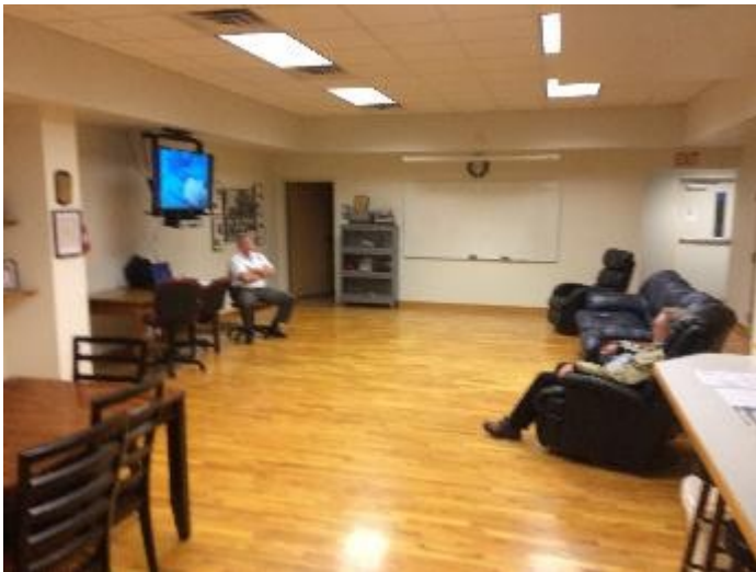
Old Sept activities