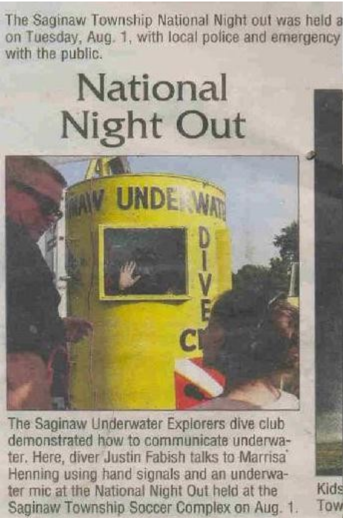
SUE makes The Saginaw News; our famous tank!