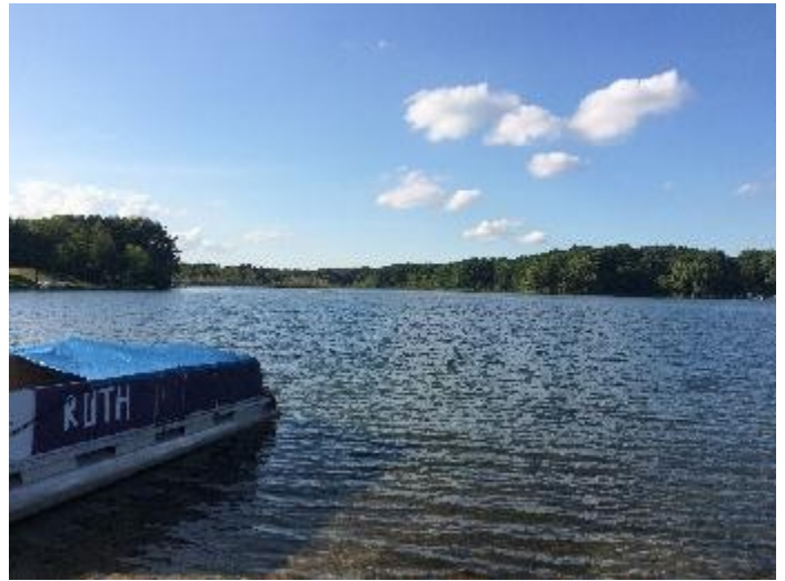
Otter Lake; Look way to the back...

We did make the monthly dive at Otter Lake and had a great time! Weather was sunny, the water was warm,... well, until we hit about 15 ft of course. Then the year-long cold water dominated.