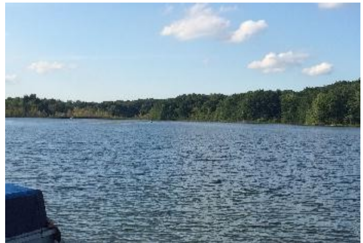
Barely visible here; look further back...