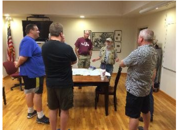
“and another possibility was...”