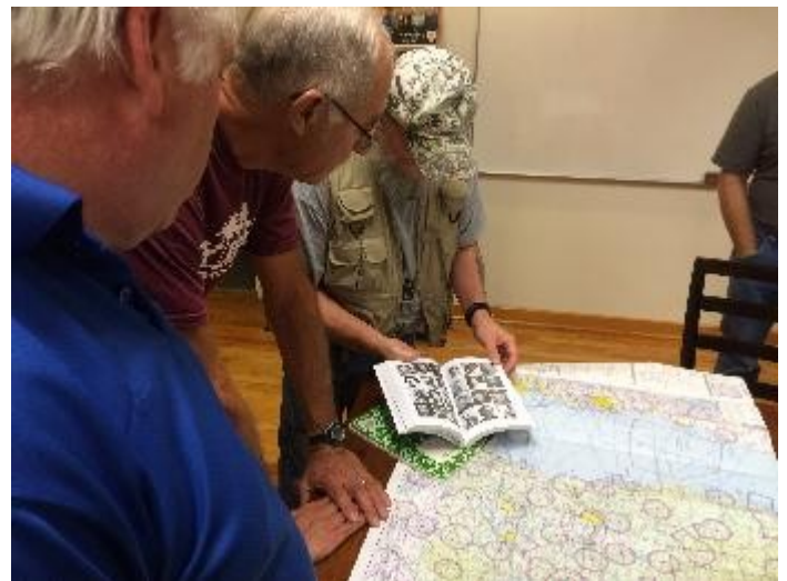
Photos remembering the victims contained in the book.