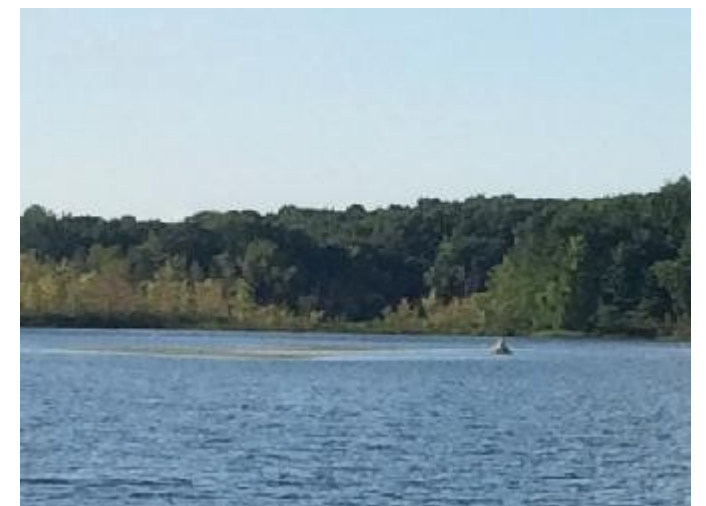
Wa-a-y back, just short of the submerged island- Appears to be some sort of rock pyramid constructed. Aliens?