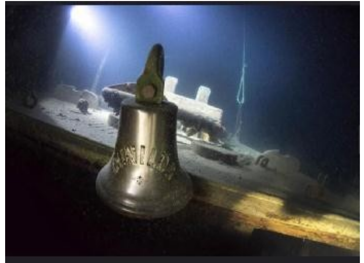
Ship's Bell, Gunilda

The Gunilda was not technically lost, but it sank in 1911 to a 300' depth in Superior and was very difficult for sport divers to access. The following are a few superb photos recently taken by a group of divers -