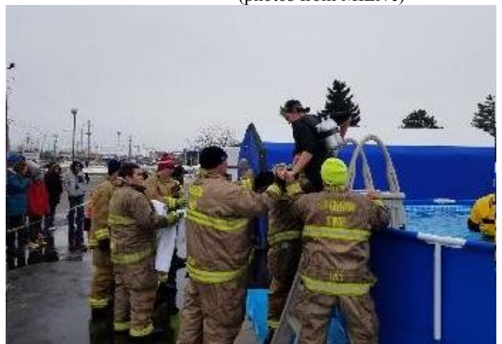
Our kind of jumper! Note 'tanks' on her back.