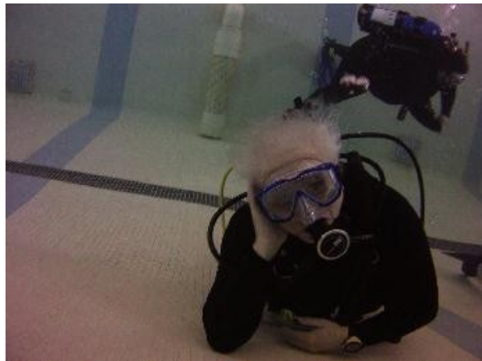
Charles more comfortable