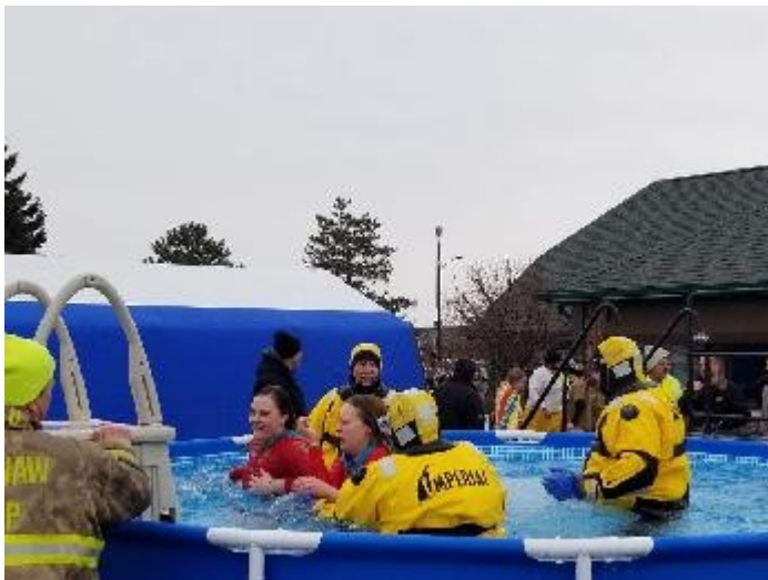
Jumpers find their own way out...