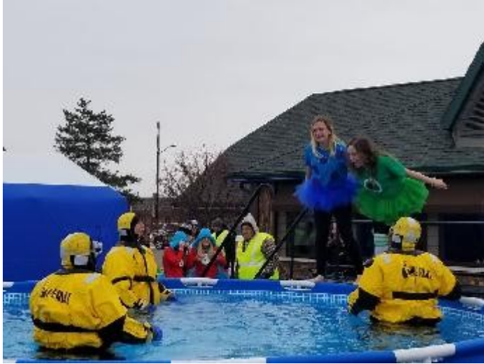
1 - 2 - 3 JUMP!