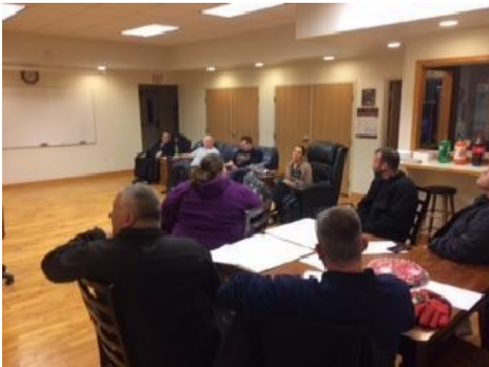
Discussion on the board openings-

Победителей мы помогли – er, I mean, the SUE club has chosen the following to be their 2018 Board: