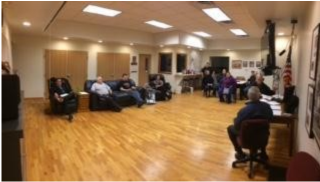
Filled the seats!