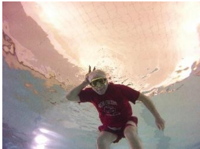
Must've lost his air hose...