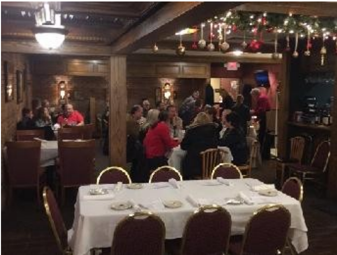
Table waiting for those of you who couldn't make it...