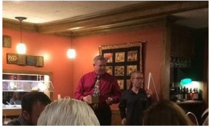
“Number 1-800-3-1-4-1-5-9-2” BINGO! (it was mine!)