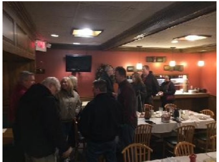
Time to check out... Thanks for coming, everyone!