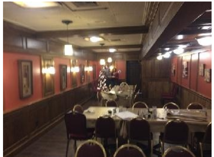
Young couple by the Christmas Tree