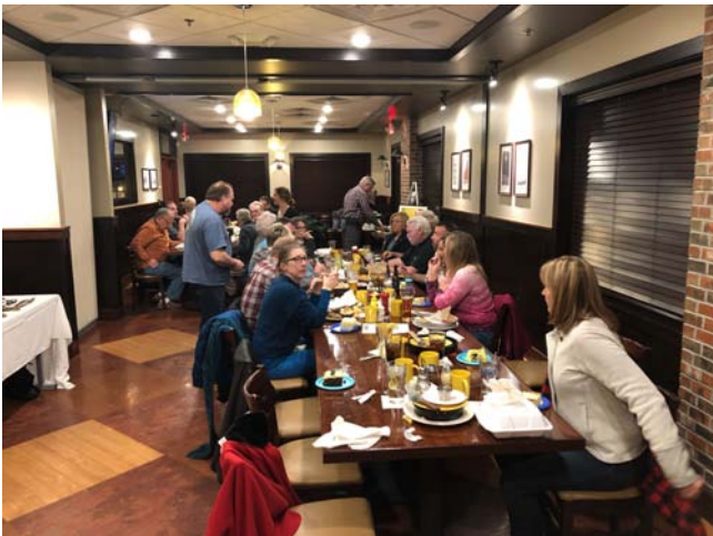
Enjoying good food and fellowship