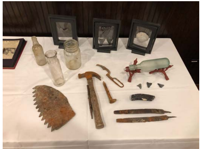
Shark teeth, glass bottles, and rusty tools. Oh my!