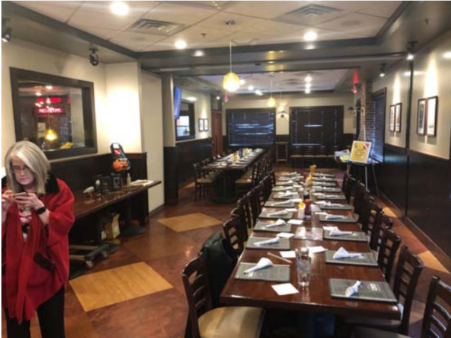
Getting set up before the guest arrive.