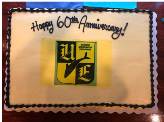
We can have our cake and eat it too!