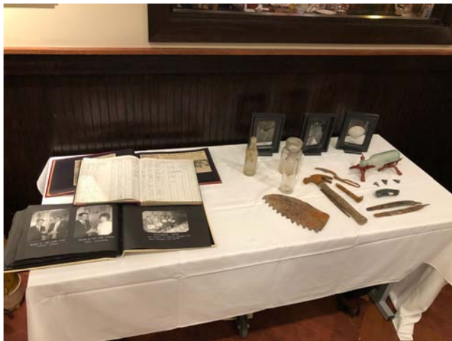
Underwater relics and old photos from the club