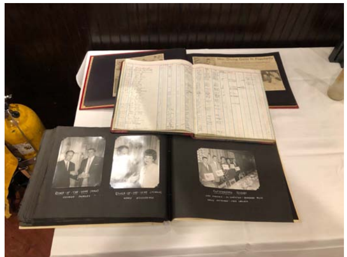
Old photos and a dive tank fill log going back to 1979