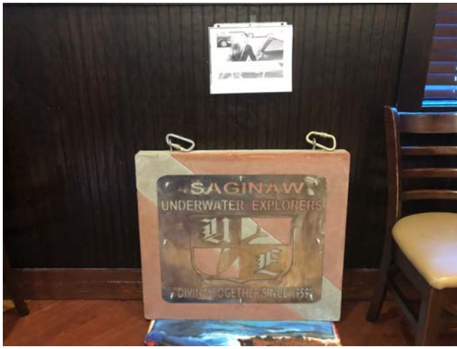
The Petosky Plaque