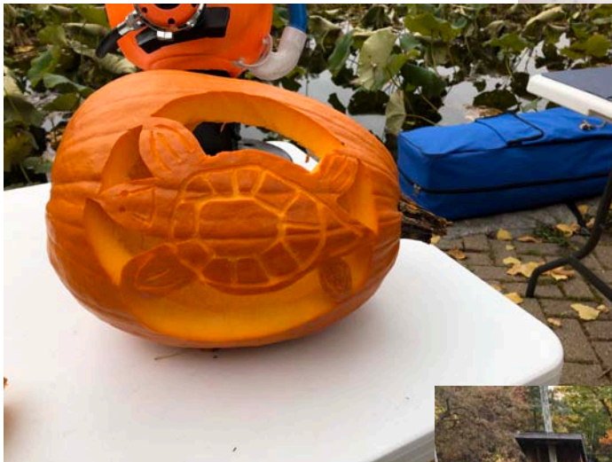
Justin's Turtle Pumpkin