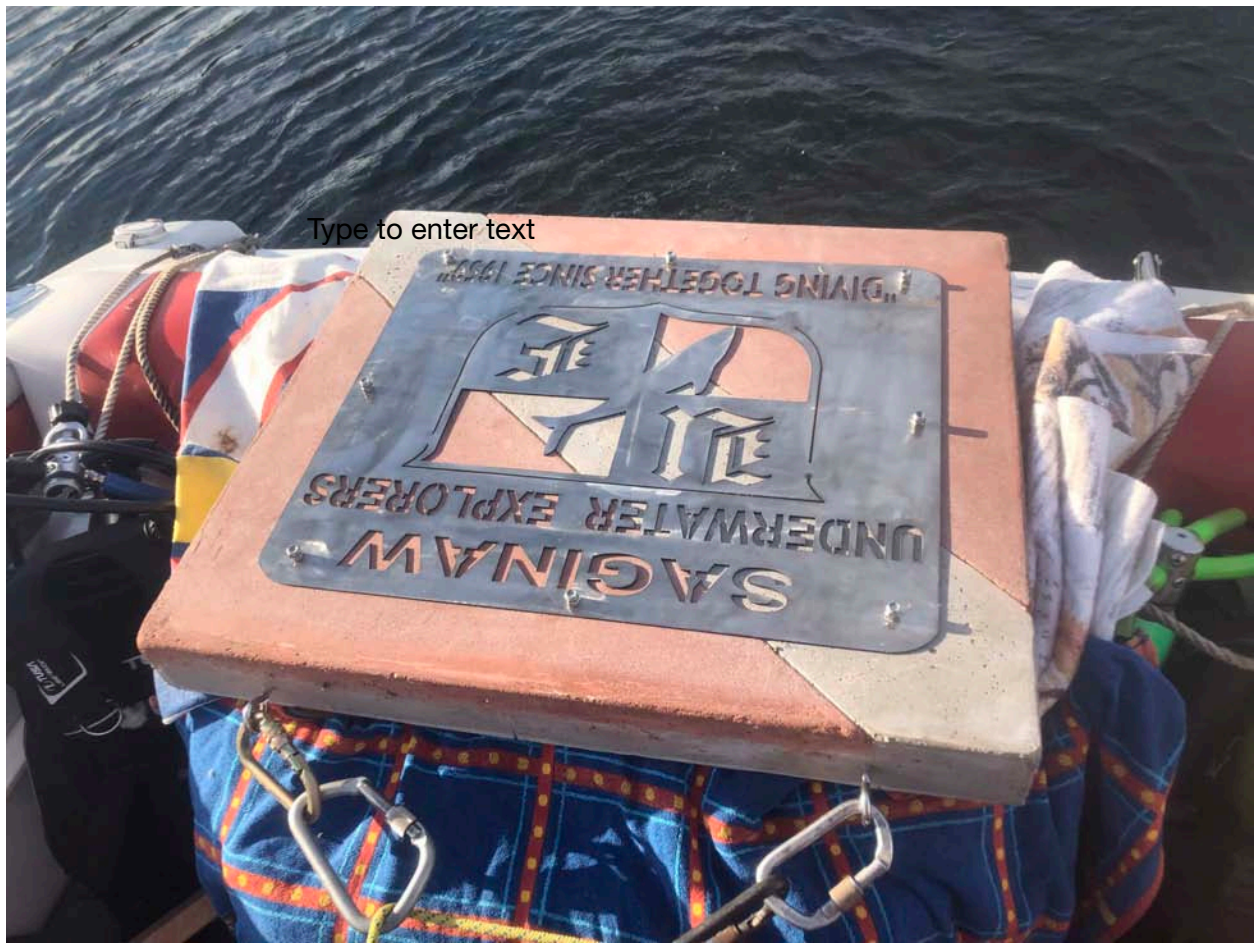
The view of the plaque off the stern of Tony's boat.