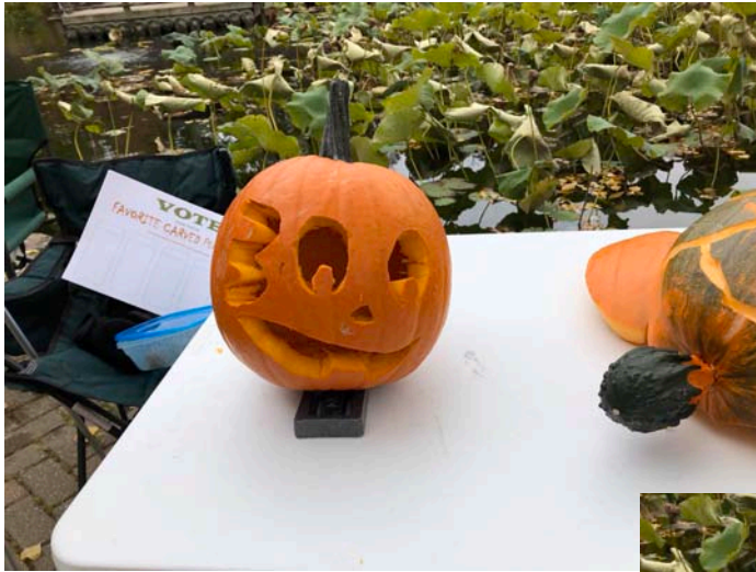
Bill's "Boo" Pumpkin