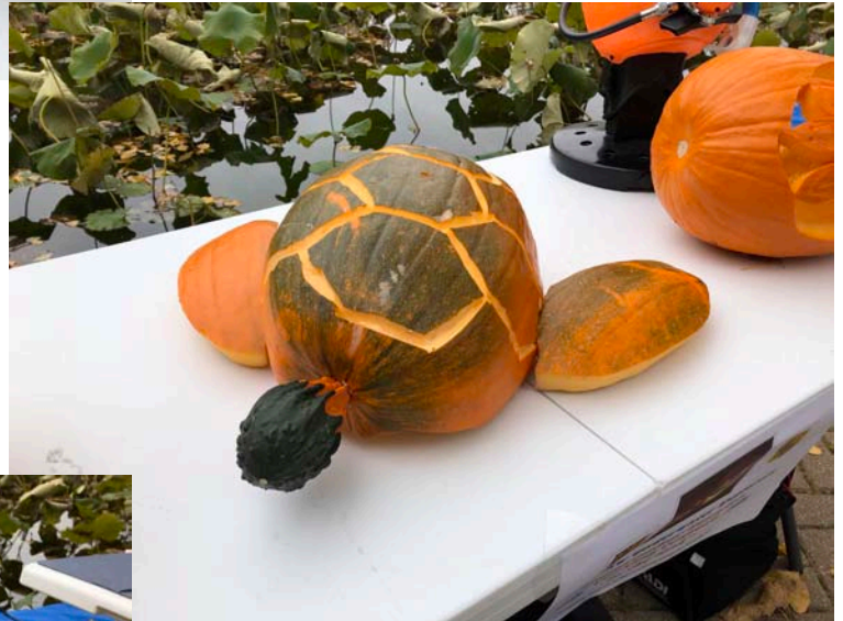
Mike's Turtle Pumpkin