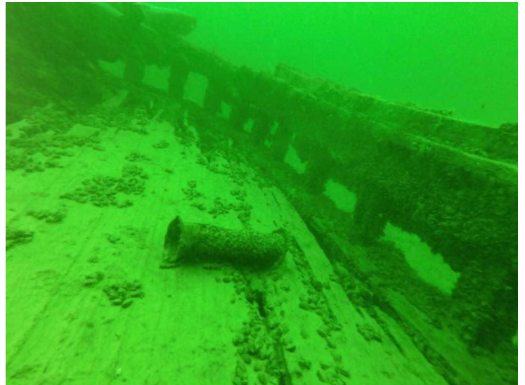
The deck of the Jacob P