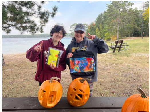
First and Second Place!