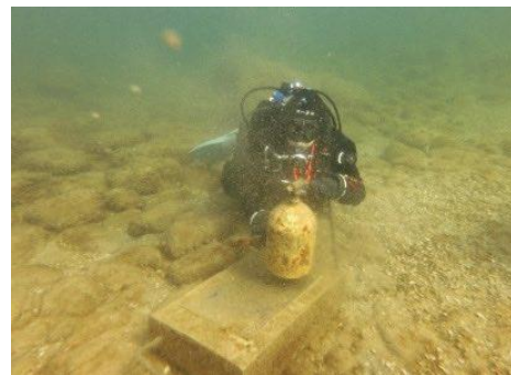
John Garner Memorial