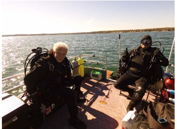
The end of a good day

The first dive took us to the Jacob P, a schooner barge that rests in 64'. The visibility was good, but very different from that found at the Keuke which was our second dive.