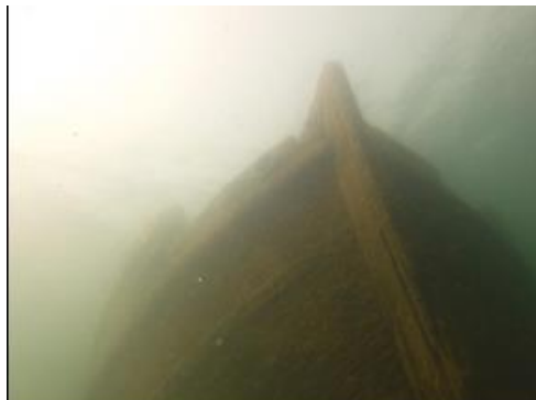
A little silty on the Bermuda