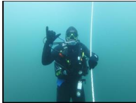
Hang-Time over the Selvic