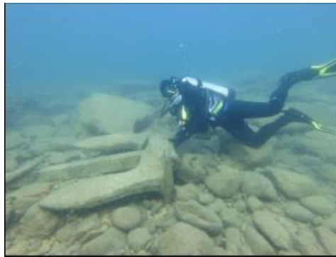
Anchor of the Hettler

Weather was great, good visibility and bottom temps mid-60's. Always a good trip to Michigan's U.P.!